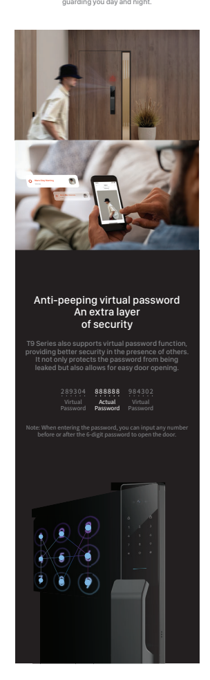
Office Mode and Homeowner Mode

Supports front door loitering capture function. If recognition falls more than twice, images will be sent to your phone for warning. Makes supplicious activities at the front door no escape picious people peace of mind at home. Combined with high-definition infrared night vision function, guarding you day and night.